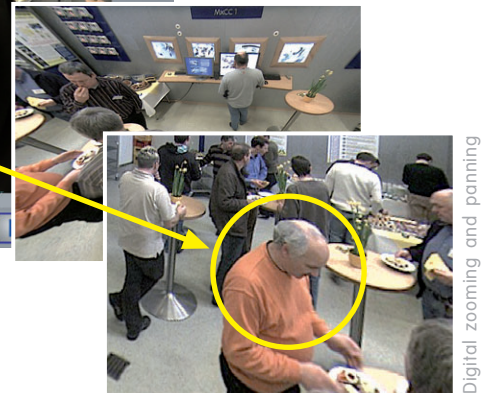
Digital zooming and panning

enables images to be zoomed in to eight times with excellent image sharpness.