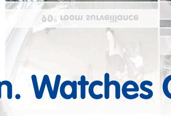
180° room surveillance