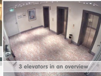
3 elevators in an overview