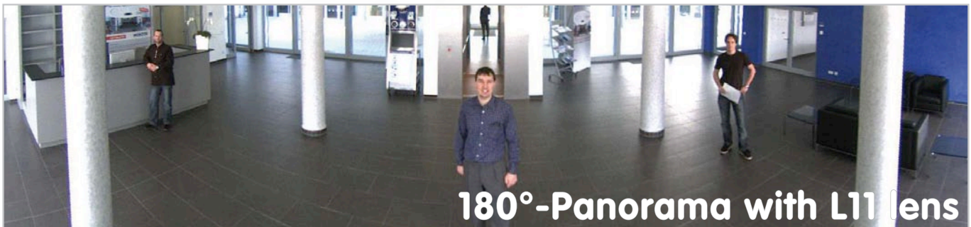
180°-Panorama with L11 lens

The M24M series from MOBOTIX offers extremely compact, cost-effective and exceptionally powerful allround cameras with the widest range of lenses, including panorama version. Fully equipped with IP66-certified housing and long-term internal storage on a MicroSD card!