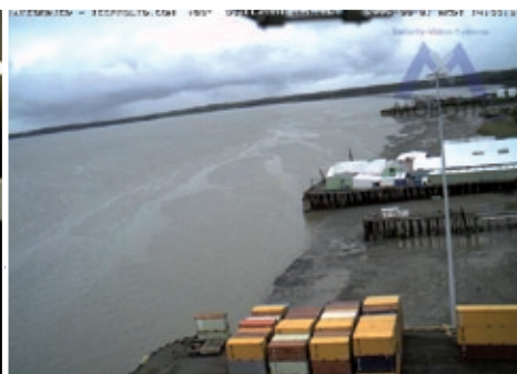
Original images by the MOBOTIX cameras