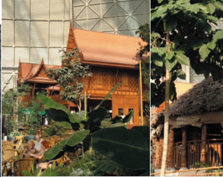
Relaxation and fun in the tropical paradise: MOBOTIX technology provides safety and security (photos to the right and below are original camera images).