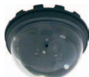
Ø 129 mm