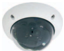
Ø 160 mm