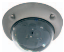
Ø 160 mm