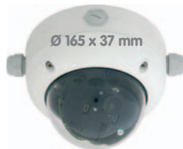
Ø 165 x 37 mm