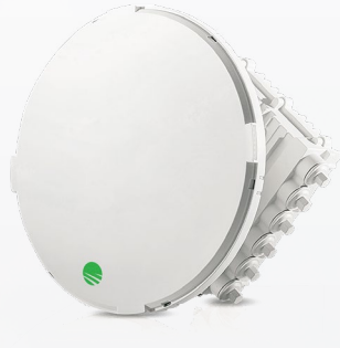
EtherHaul™ Kilo Rooftop