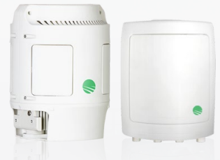
MultiHaul™ TG Mesh

Plug-and-Play Street level up to 1.8Gbps Aggregated