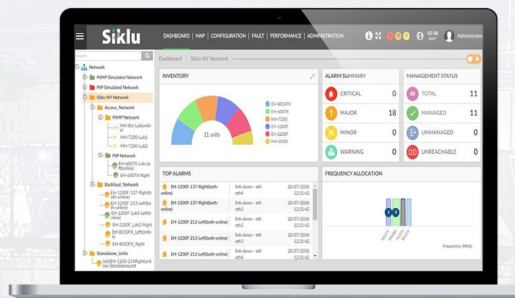
Siklu SmartHaul™ Network Software Tools