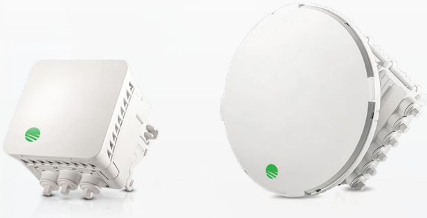
EtherHaul™ Street Level