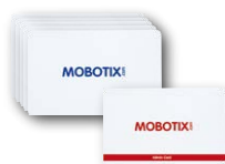
RFID cards for keyless entry