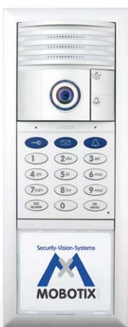
IP Video Door Station