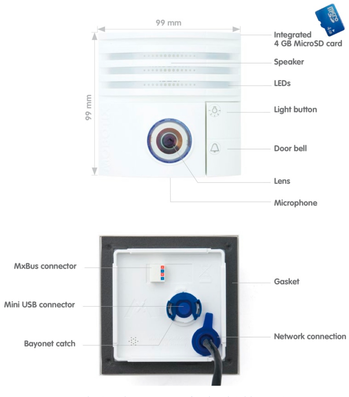
(T25 - Camera housing and connectors, excerpt from the technical documenation)

However, due to technical reasons, it is necessary to exchange an older existing T24-DoorMaster for the new MX-DoorMaster (article number: MX-Door2-INT-PW).