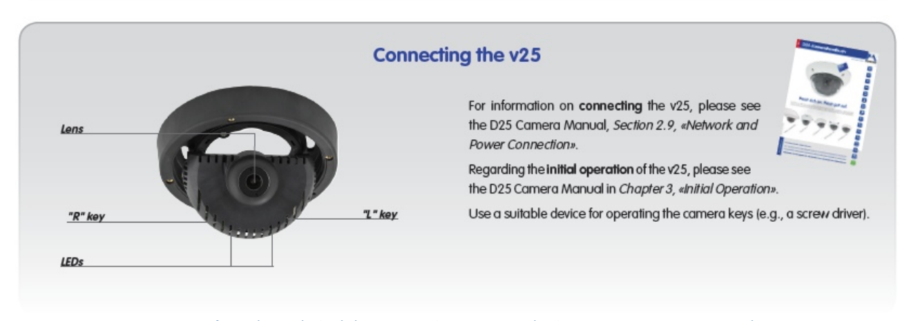
(Excerpt from the technical documentation: www.mobotix.com > Support > Manuals)