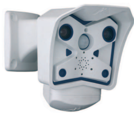
M12D with SecureFlex wall mount