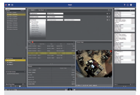
MxMC: Receipt with video evidence of issue

is developing a joint solution for cash register integration with intelligent IP cameras from MOBOTIX. This involves linking the transaction data for each sales process with video data and saving it directly in the camera.