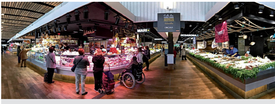
Optimal overview and service optimization