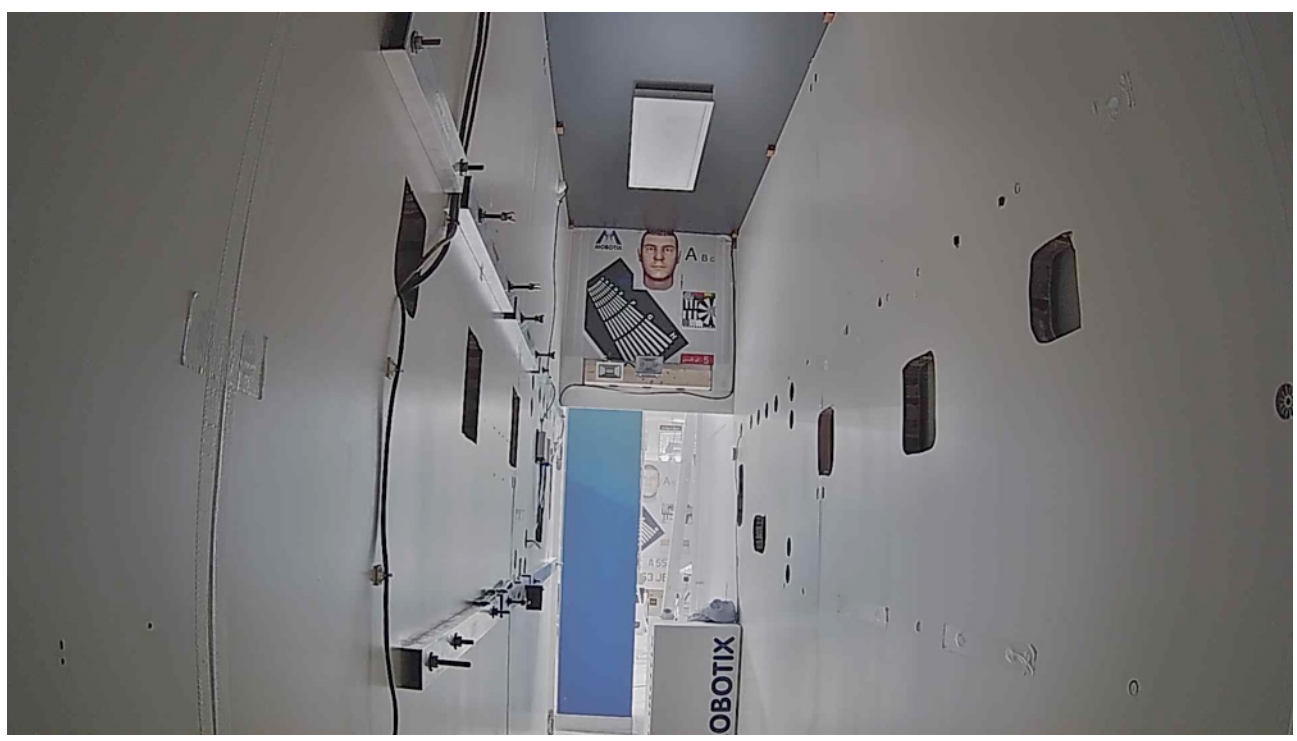
Original MOBOTIX MOVE camera image with activated WDR function: Details are easily recognizable within the dark testing room as well as at the open door with bright light entering through it. The camera automatically combines two differently lit individual images taken within a minimal time difference, thereby forming a live complete image.