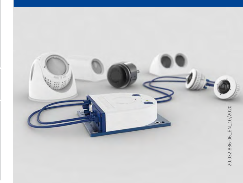
Beyond Human Vision