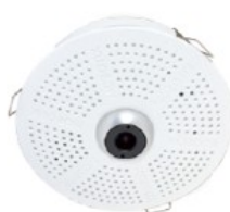
c26 with lens B036