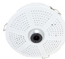
c26 with lens B036