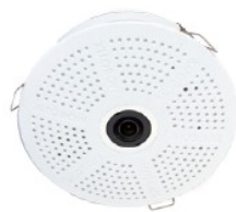
c26 with lens B016