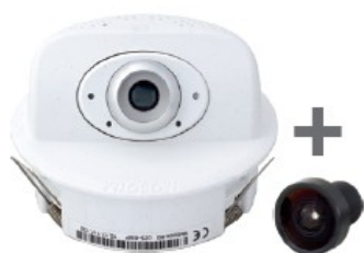
p26 camera body und lenses B036 to B237 for self-mounting