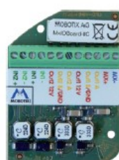
MxIOBoard-IC for signal input/output (accessories)