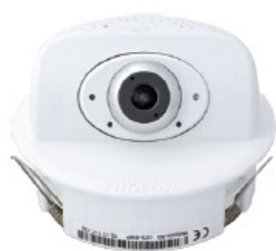
p26 camera, lens B016-B237