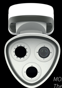
MOBOTIX M73 Thermal/TR