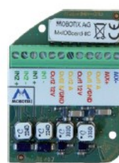
MxIOBoard-IC for signal input/output (accessories)