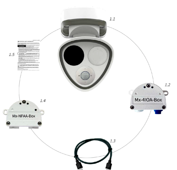
Scope of Delivery M73 FM Bundle

Unlike many fire detection solutions that require extensive component sourcing, engineering effort, and system integration, the MOBOTIX M73 Thermal FM Bundle is delivered as a complete, pre-configured solution package designed specifically for ANSI/FM 3260-compliant Thermal Image Fire Detection applications. The bundle combines all essential hardware components required for thermal monitoring, alarm signaling, and FM-compliant system integration in a single solution architecture.