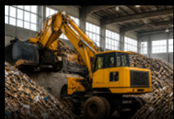
Waste & Recycling