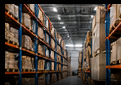
Logistics & Warehousing

FIRE DETECTION IS ESSENTIAL. EARLY DETECTION PREVENT ESCALATION.