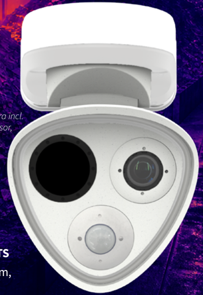
M73 high-end camera incl. 95° VGA thermal sensor, 4K image sensor & MultiSense