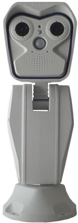
for Mobotix M14/15/16 and M24/25/26